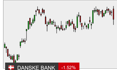
Upgrades Guidance After 2Q Beat