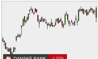
Upgrades Guidance After 2Q Beat